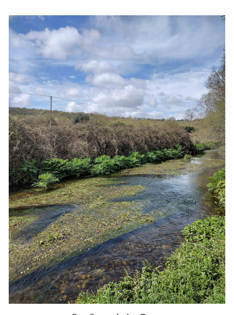
Bere Stream by Lyn Traves