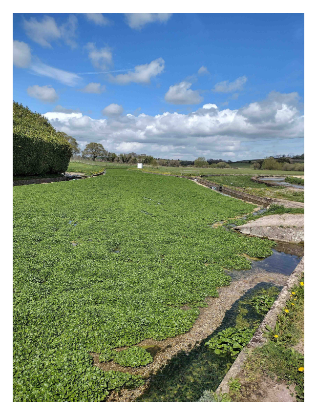
Watercress Beds -Bere Regis by Lyn Traves