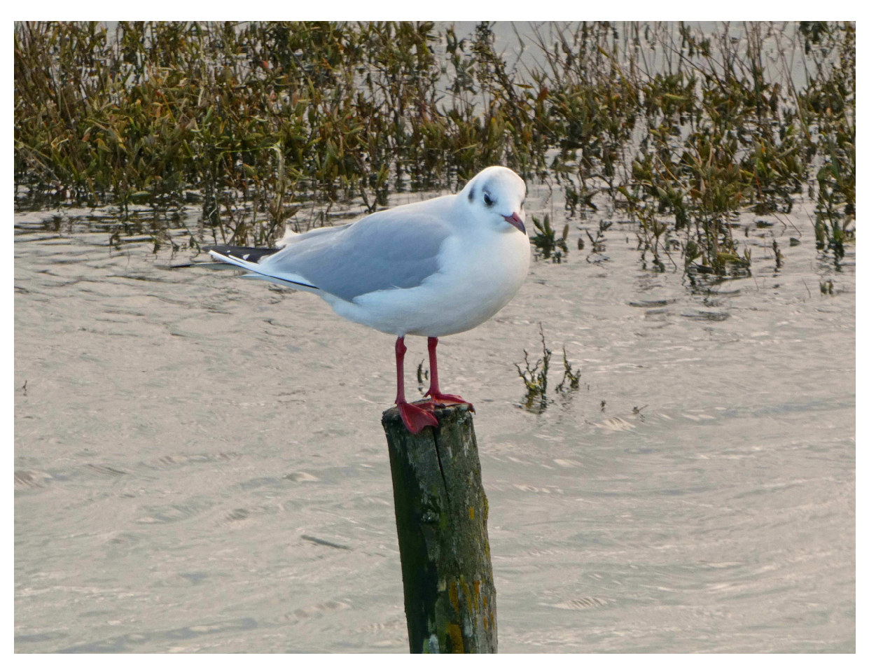
Black-headed Gull at Keyhaven by Gerry Traves