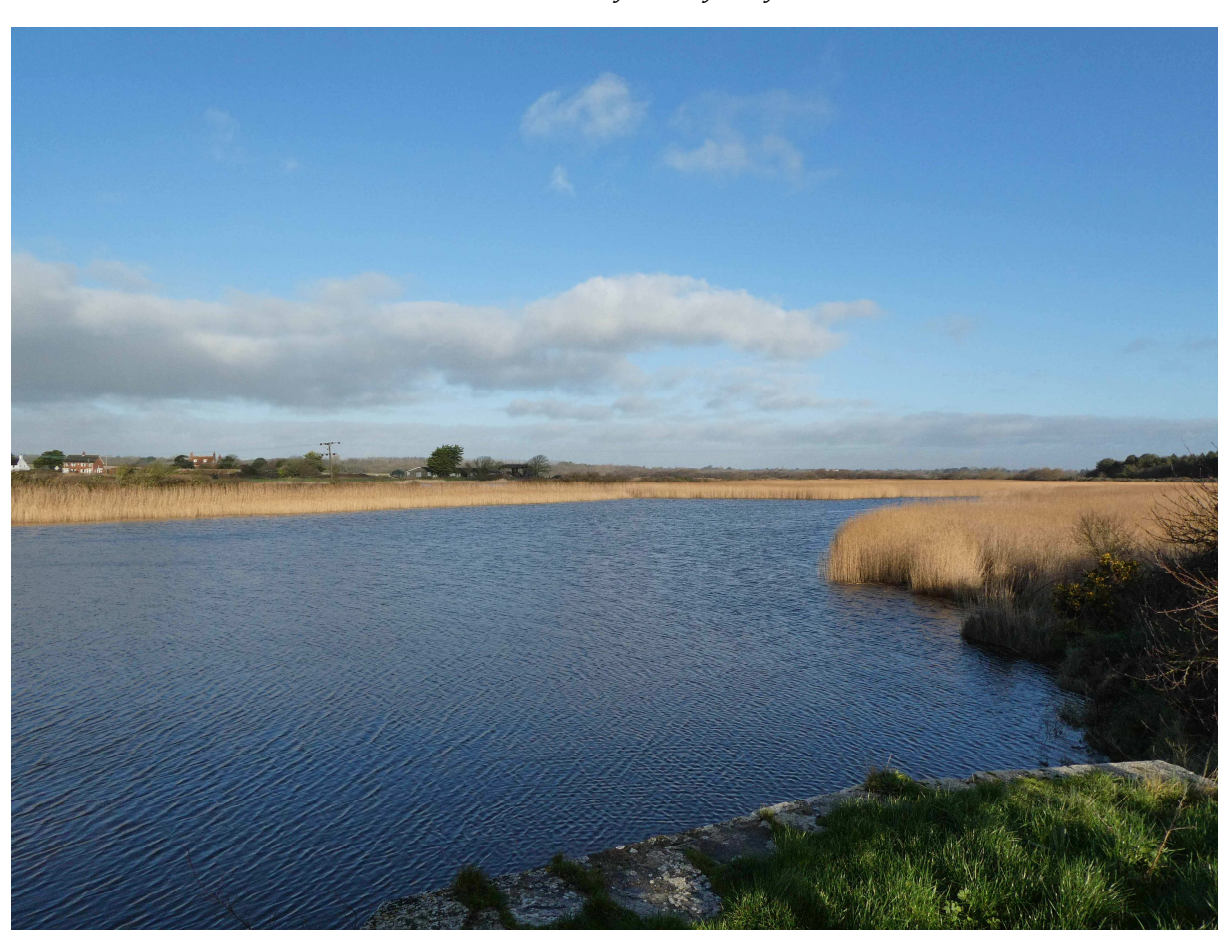
Avon Water at Keyhaven by Gerry Traves