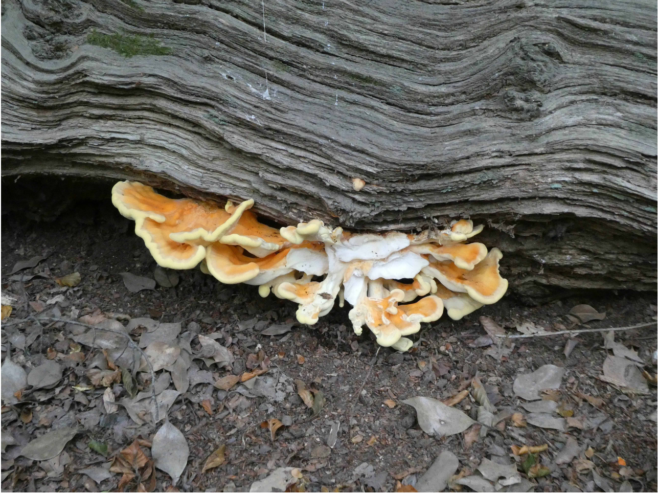
Newly emerging Chicken of the Woods at Burley by Gerry Traves