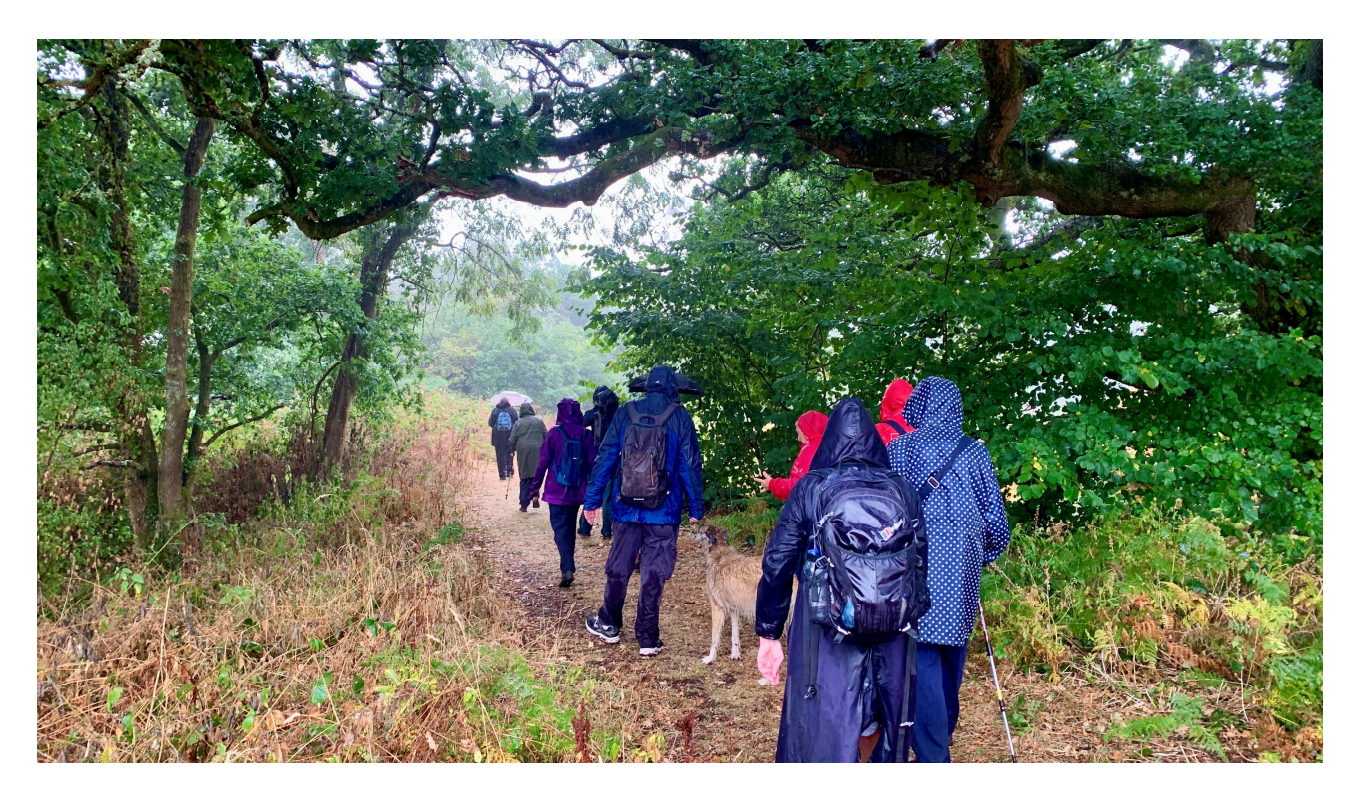
Edmondsham in the rain