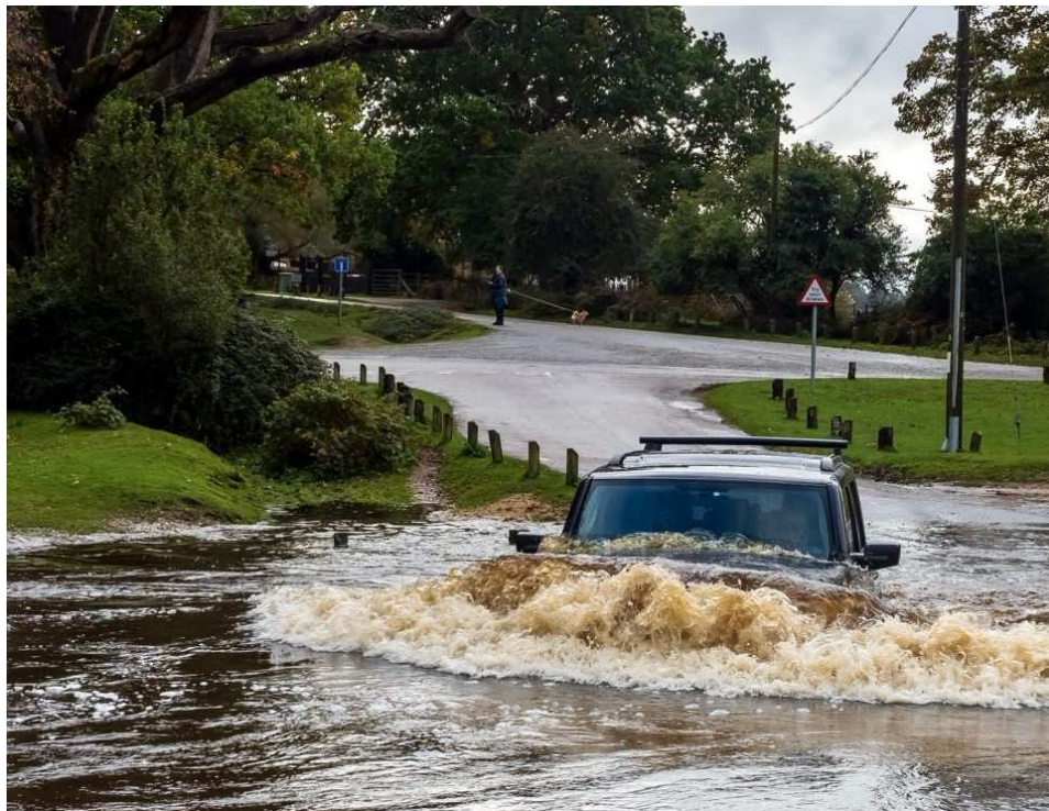
A car attempted to drive through the ford!