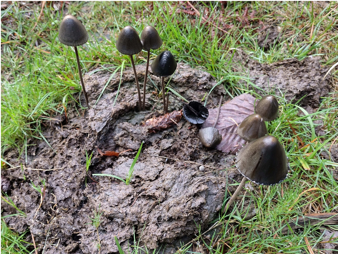
Petticoat Mottlegill by Lyn Traves