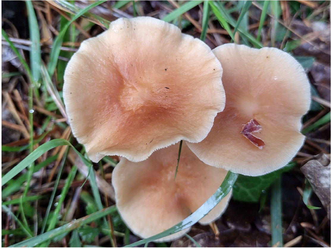
Common Funnel by Lyn Traves