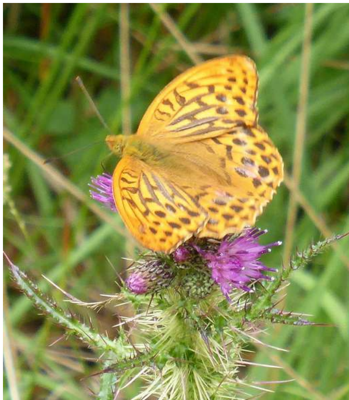
Standing Hat Walk - Silver-washed Fritillary by Lyn Traves