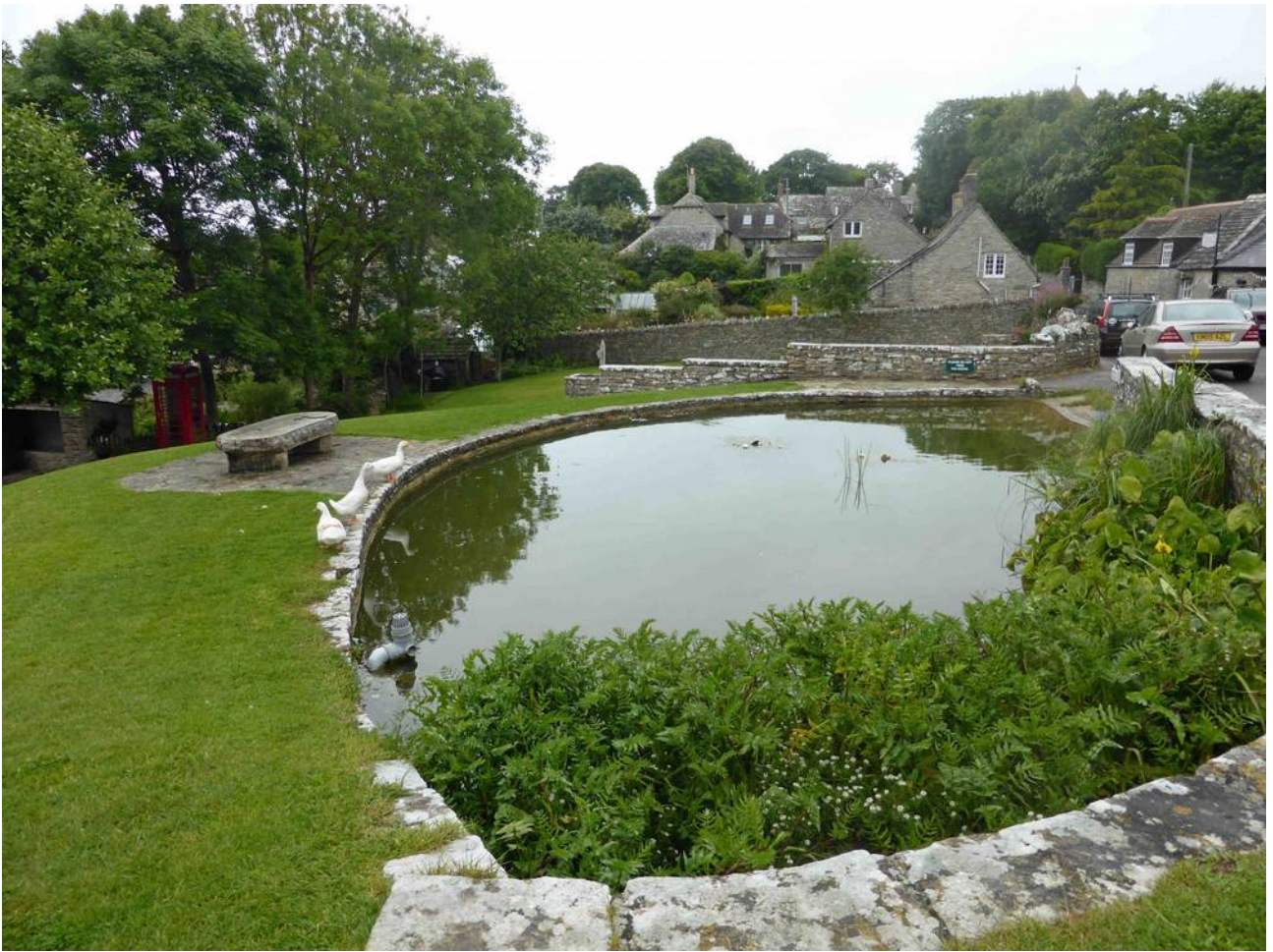
Worth Matravers Duckpond by Lyn Traves